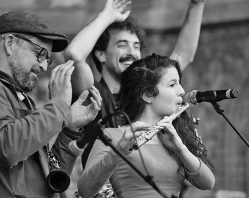
Banda Comunale at the closing ceremony for the 32nd Intercultural Days