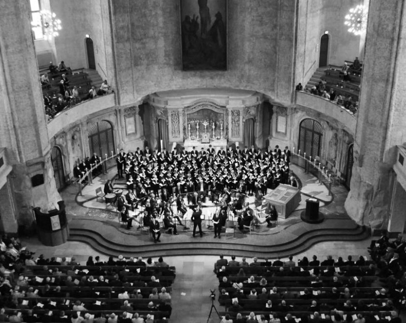
↑ p. 20: Kreuzchor choir at vespers in the Kreuzkirche