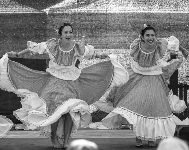
↑ p. 39: Stage programme at the Intercultural Street Festival in 2022 | Photograph: Matthias Naumann

3.30 – 6.30 p.m. arts and crafts Klotzscher Treff, Göhrener Weg 5 Batik fabric design We will be tie-dying fabric using the batik crumple technique. The fabric is dyed, pleated, tied up and finally set by boiling. We'll use the time between each step to get to know one another better. For adults only. Register at info@bernstein-ev.de or by phone on (01 73) 3 71 10 66 by 22 September Organised by: Bernstein e. V. Abenteuer (er)leben